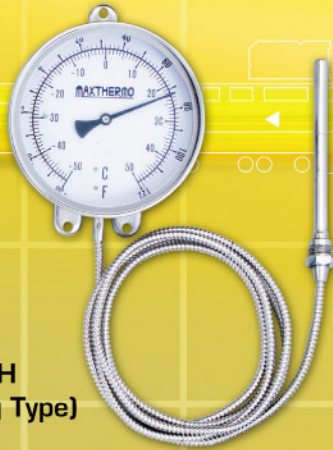
MA-102H (Hanging Type)